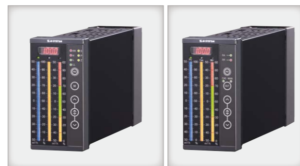
SD10: 3-channel Bargraph Indicating Alarm SM10: Manual Loader