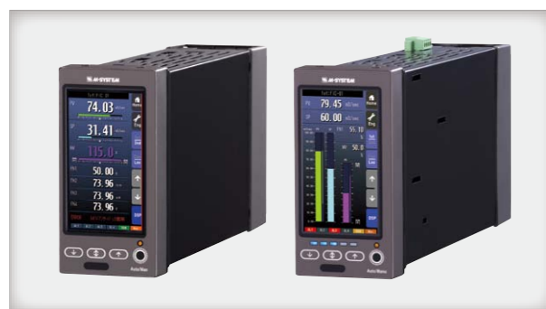
SC100: Basic version SC110: Basic version with manual loader SC200: Modbus / NestBus SC210: Modbus / NestBus extension version