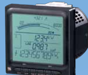
54U / 54UC / 54UL 110-mm square panel size