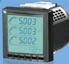
53U 96-mm square panel size