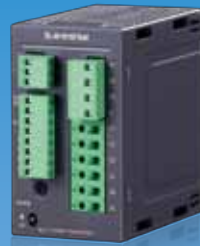
L53U DIN rail mounted