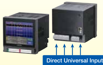
Direct Universal Input