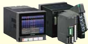
Built-in I/O Module